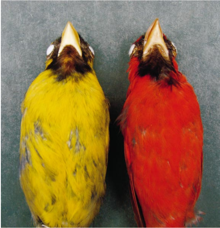
FIGURE 1. Reference photograph of the mutant yellow cardinal, placed next to a museum specimen of a wild-type red cardinal.

et al. 2000), and this central-cleavage process is much different from the end-ring oxidation reactions that are more common in birds (Stradi 1998, Stradi et al. 2001). Ultimately, to better understand how and why birds complete these pigment transformations, more consideration should be given to the biochemical and genetic systems that regulate the enzyme(s) that metabolize dietary carotenoids.